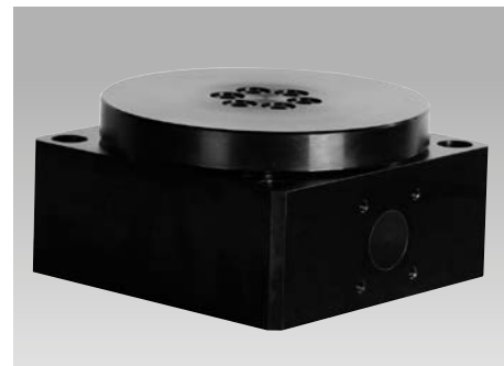
Rotating module - vertical axis DMV 1000 with flange plate Ø 170